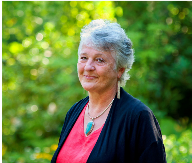
High Res 300 dpi